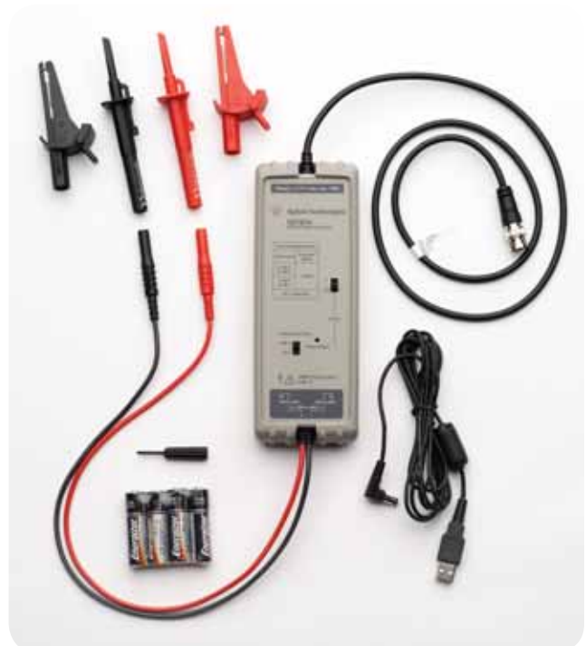
Figure 1: Agilent's N2791A 25-MHz differential active probe.

MIL-STD 1553 eye-diagram mask testing is based on capturing and overlaying all "1" and "0" bits of the differential bus. The differential bus must be probed using a differential active probe. Agilent recommends using the N2791A 25-MHz differential active probe shown in Figure 1. The attenuation setting on the probe should be set to 10:1 (not 100:1). The output of the probe should be terminated into the scope's default 1-M \Omega input termination.