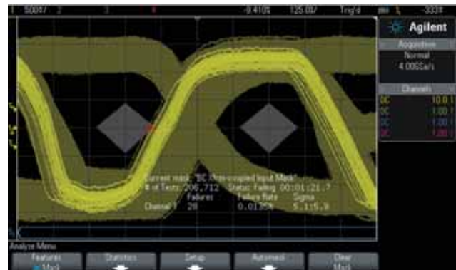
Figure 4: MIL-STD 1553 eye-diagram mask test on Status Words received at the Bus Controller.

A “BC Input Mask Test” will perform an eye-diagram mask test on all Status Words received at a Bus Controller (differential probing point) with all status bits set to “0”. An example of this test is shown in Figure 4.